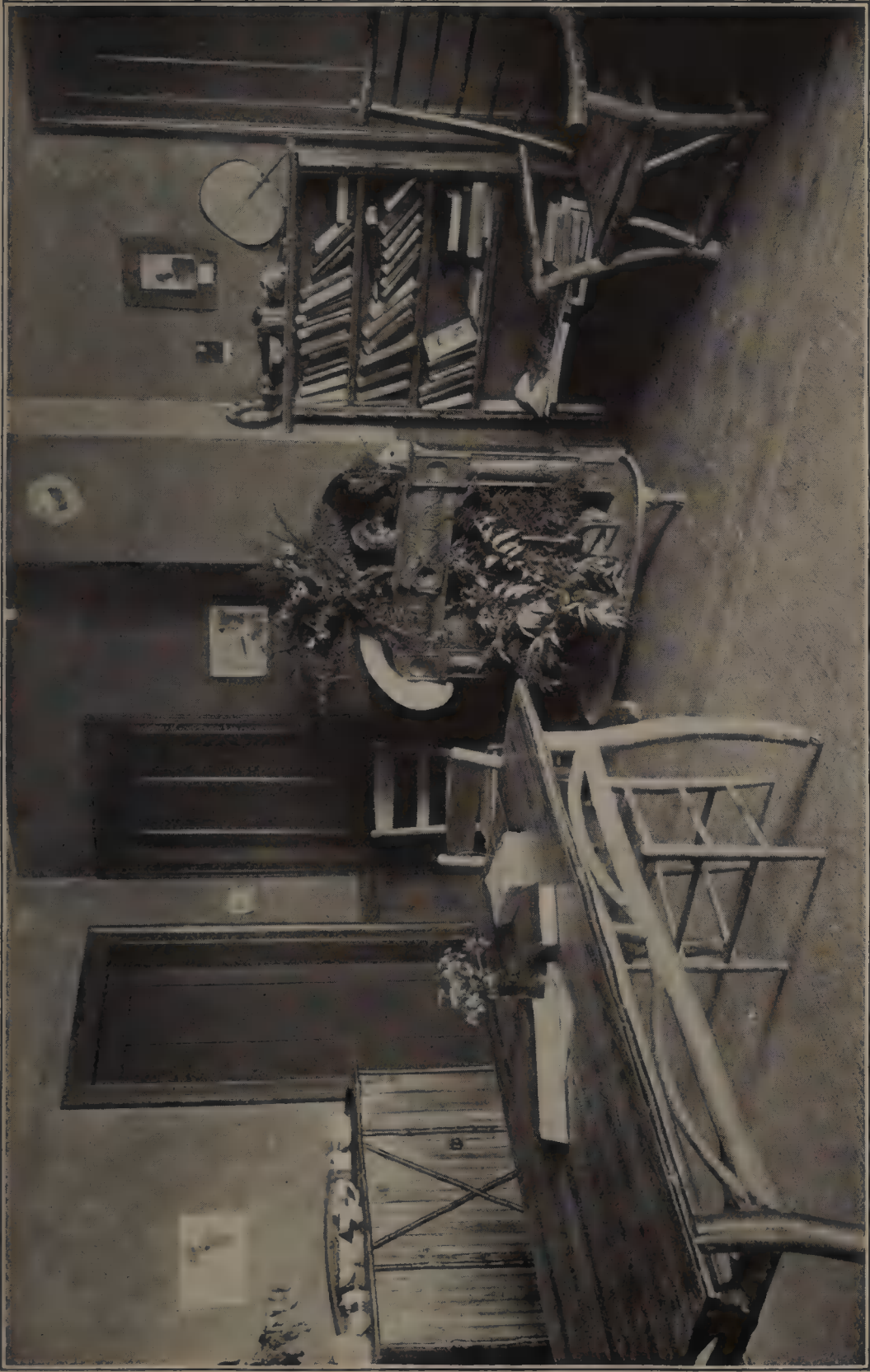
LIVING-ROOM, WOODCHUCK LODGE, WITH RUSTIC FURNITURE MADE BY MR. BURROUGHS